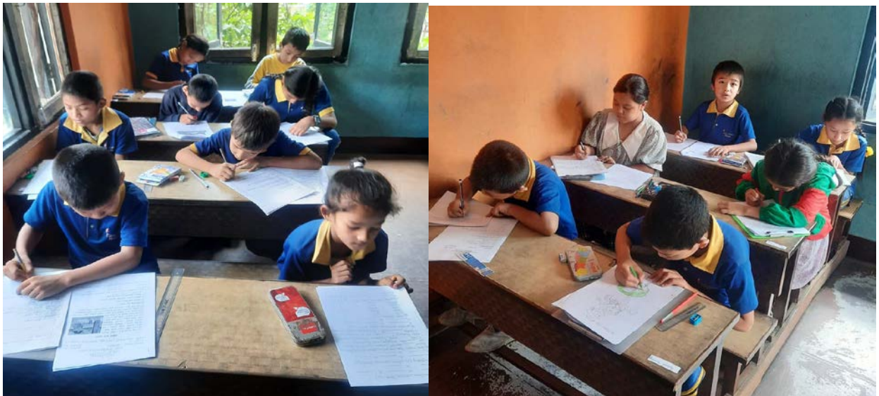
Students of class One to class Three appearing for their first terminal examination. Good luck to all!