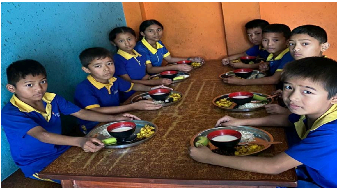
Students are having Yoghurt and Beaten Rice during international mud day.