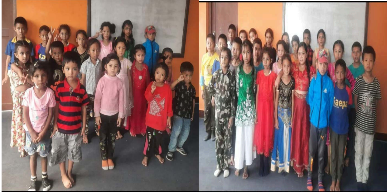
These photos were taken on the day of Teej festival. Students are dressed in colorful clothes on this day.