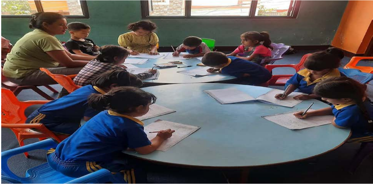
Students of class Nursery and class LKG appearing for their exam.

In this month, we completed the first terminal examination. We conducted the first terminal examination in the school from August 10 to August 15. Therefore all the teachers were busy to preparing the question papers and the students were busy to preparing for the exam. This year, the publications couldn't provide the books on the time so, the books did not reach our school on time. The teacher held extra classes to complete the course for the first terminal examination. The students also had to work harder for this. In this way, the first terminal examination was successfully completed with the hard work of both the teachers and our little students.