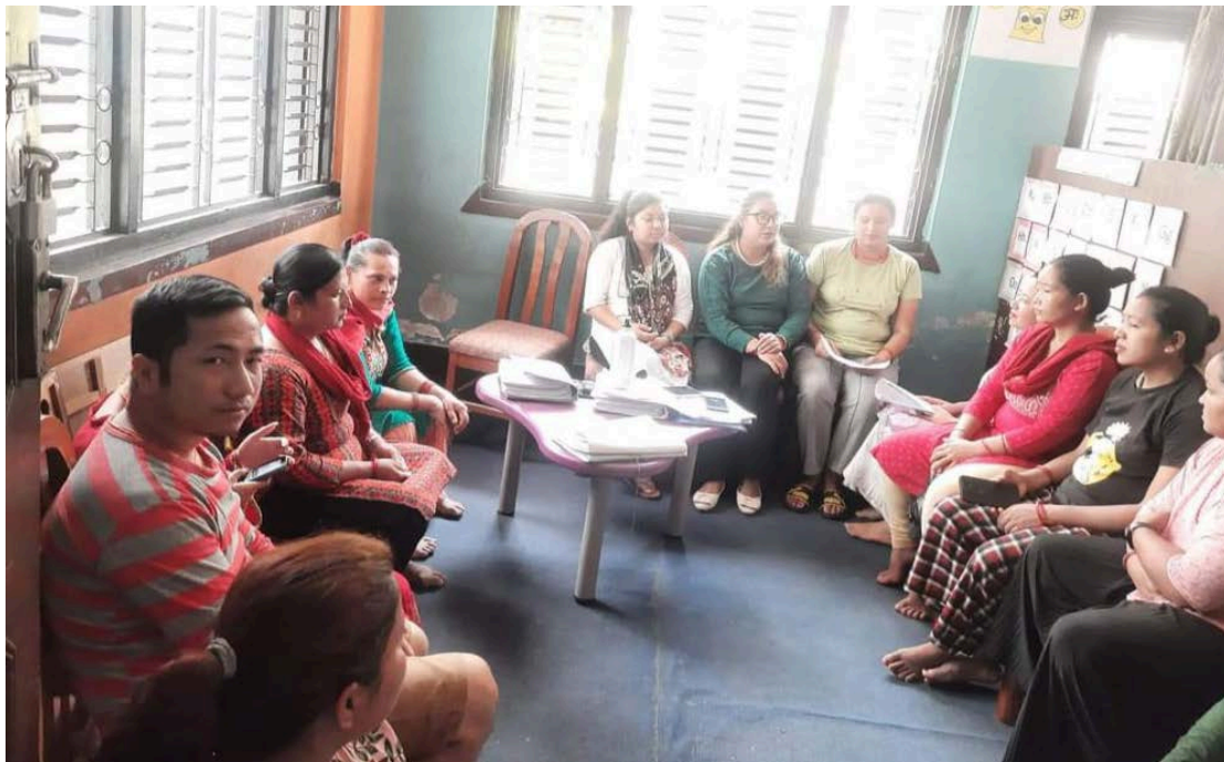
On the day of Result distribution, there is a discussion about children between teachers and parents.