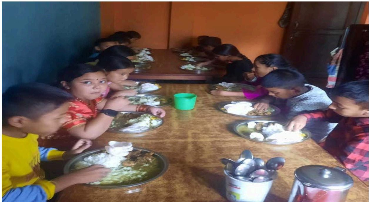
Students of Filosofiska Nepal eating daar during teej festival.