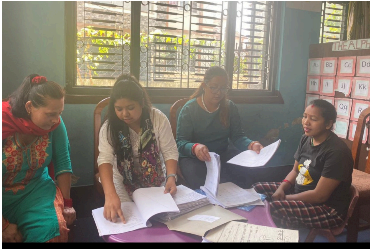
Teacher are showing their children's answer sheet to the parents as well as distributing the children's results.