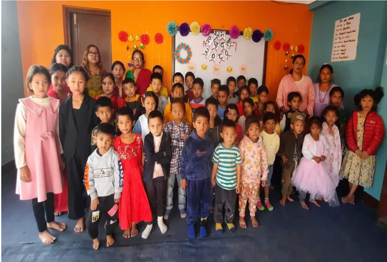
Group photo session taken at the last stage of Tihar program.