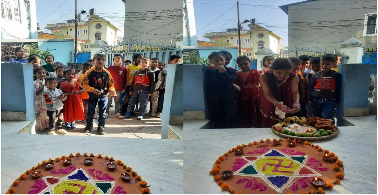
Some pictures of the adorable moments of the kids singing Deusi and Bhailini songs.