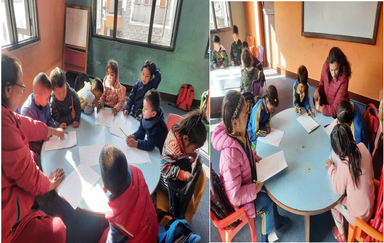
Students of class nursery are appearing their exam with the help their teachers.