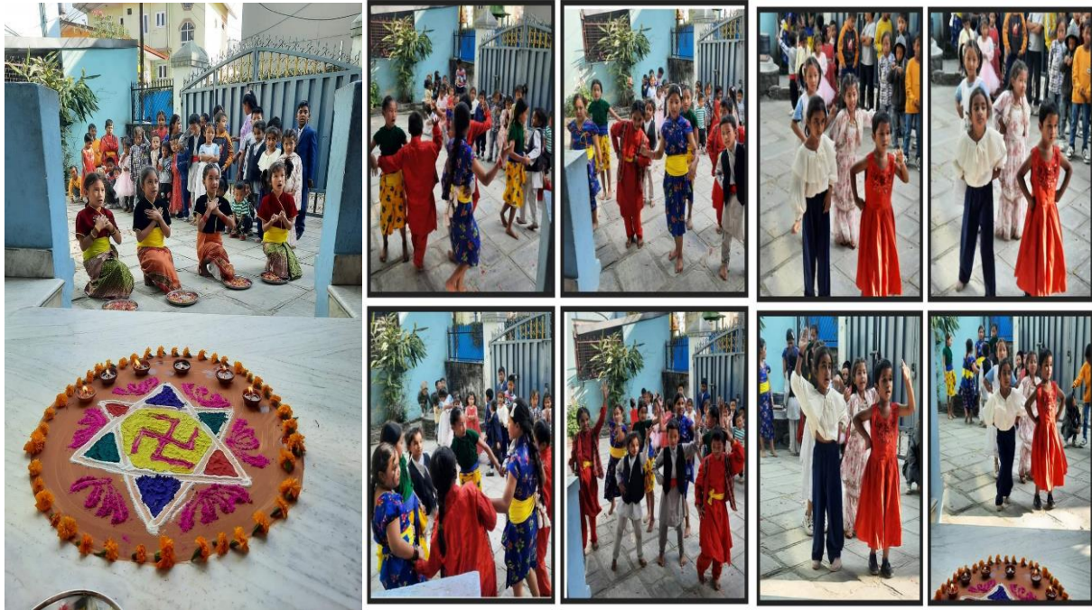
Some pictures of dances presented by students from class L.K.G to class three in the Tihar special program. On this day, students dressed up in cultural costumes and performed dances on various Tihar songs. Thank you Smriti Rawat for this.