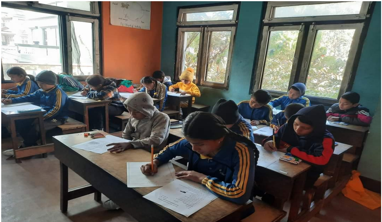
Photo of Students from class one to class three are giving their exam calmly.