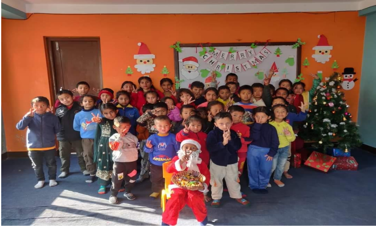
On December 25 of this year, we celebrated the great Christian festival of Christmas at the school like every. Children are attended school mostly in red outfits. All the children were happy and eager to celebrate Christmas since morning because they had been practicing