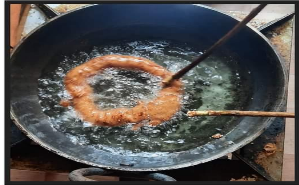
Some glimpses of the special preparations made for the Tihar program.