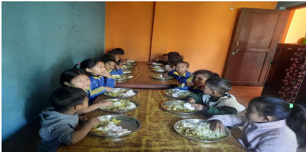
Students of Class L.K.G and Nursery are having their lunch in her birthday.